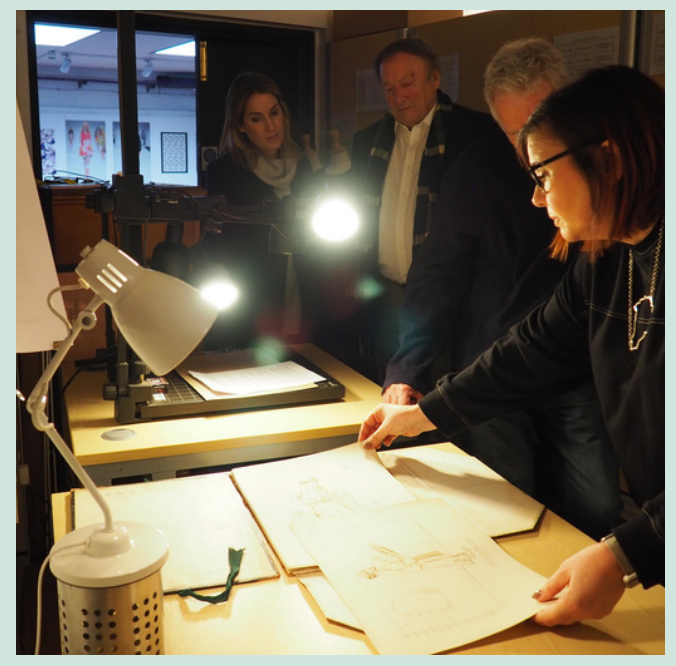
UKNA City Takeover: Nottingham 2019.